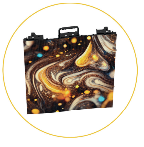
Refresh Rate of 3.840 Hz