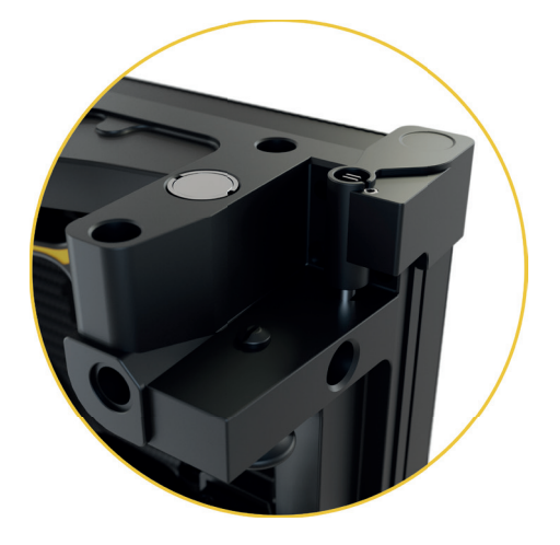
On Board Curve Mechanics +/- 10°

Flip Corners Shield and Bottom Protection