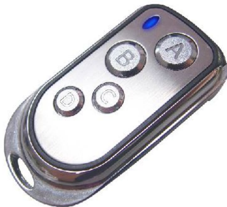
W-2 Wireless Transmitter

Wireless remote control system W-2 consist of a transmitter equipped with four buttons to activate four user configurable LED setting and fog; with an onboard receiver attach to the rear panel of Z-1520 RGB.