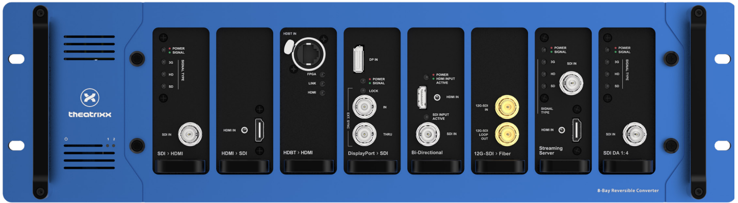
Power Input LEDs