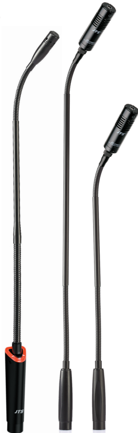
GM-5212SW/GM-5218SW GM-5218T GM-5212T