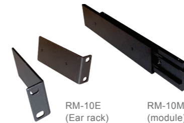
RM-10E (Ear rack)