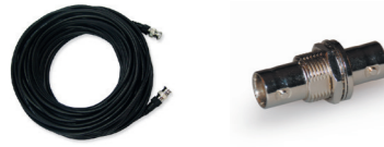
RTF-20 / RTF-20-5D