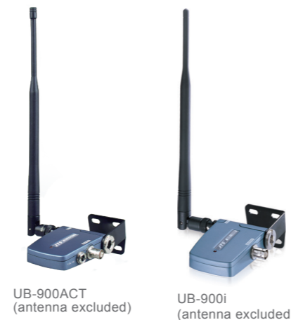
UB-900ACT (antenna excluded)