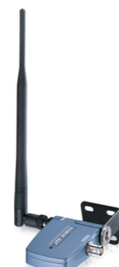
UB-900i (antenna excluded)