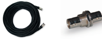
RTF-20 / RTF-20-5D