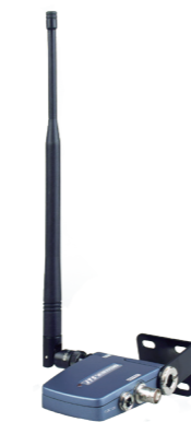
UB-900ACT (antenna excluded)