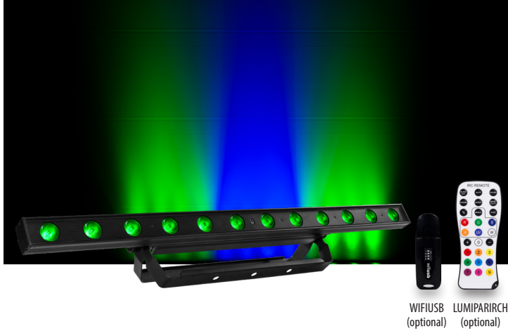
WIFIUSB (optional) LUMIPARIRCH (optional)