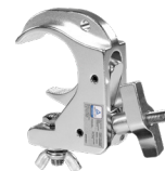
■ C6034A ■ C6034B

Clamp manufactured from die-cast aluminium for light-weight equipment (SWL 200 kg), compatible tubes of 48-51 mm. The design has been conceived to eliminate truss damage usually associated with steel hook clamps and grants a faster mounting through two turns of the knob