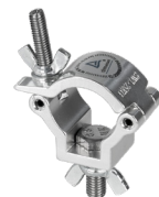
■ C6005A ■ C6005B