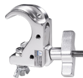
■ C6035A ■ C6035B

Clamp manufactured from die-cast aluminium for light-weight equipment (SWL 75 kg), compatible tubes of 32-35 mm. The design has been conceived to eliminate truss damage usually associated with steel hook clamps and grants a faster mounting through two turns of the knob