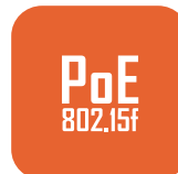
Power over Ethernet