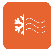
Natural Heat Convection