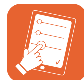
User-Friendly Web Interface