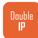
2 IP addresses per Device