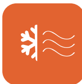
Natural Heat Convection