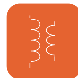
Galvanically Isolated Ports