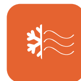
Natural Heat Convection